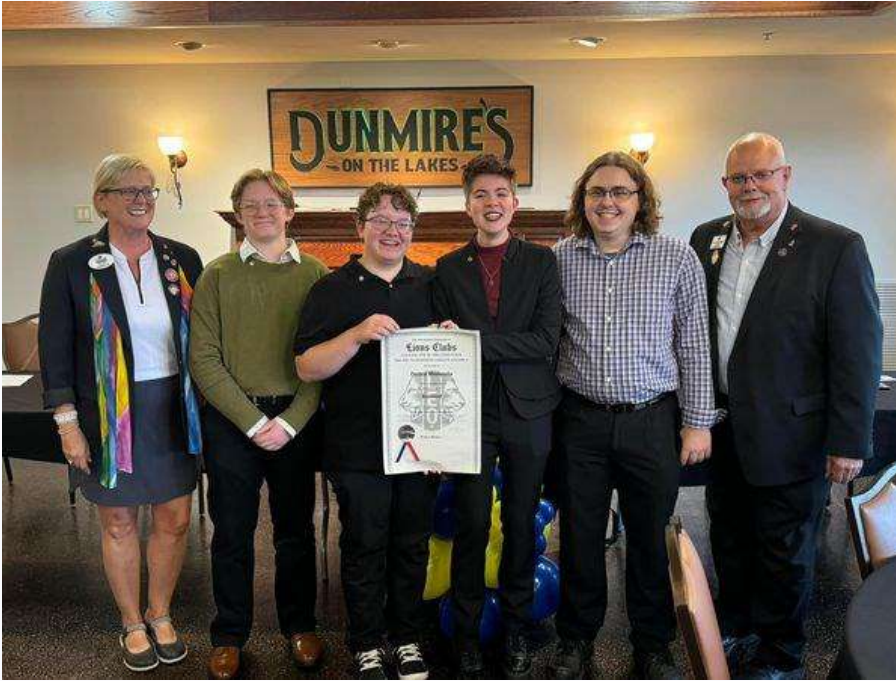
Central Minnesota Omega LEOS Club