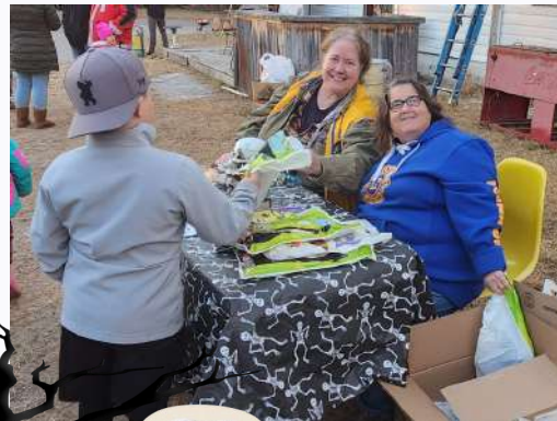
The Nisswa Lions and Nisswa Fire Department teamed up for a successful Haunted Barn and Hay Rides event, enjoying a large turnout.