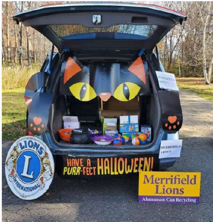
Merrifield Lions participated in a trunk or treat for Halloween!