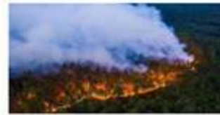
Natural disasters are impacting communities across the world, including right here in the

Natural disasters are impacting communities across the world, including right here in the United States.