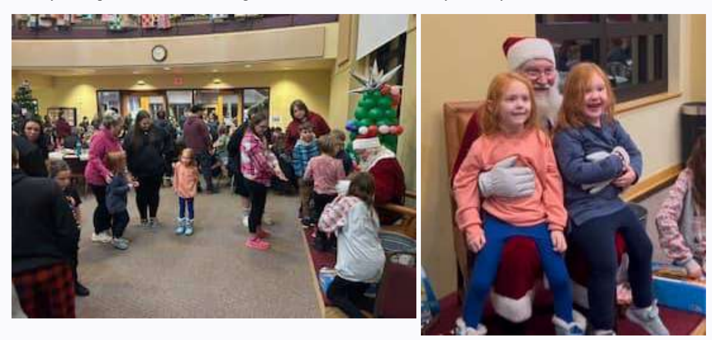
Brainerd Lions host Spaghetti with Santa. Everyone had an exceptional evening. Santa visited with over 150 children. Spaghetti was delicious and the atmosphere was festive.

This is what happens when Palisade Lions asked our community to lend a hand on Christmas Eve Day to help distribute food through Second Harvest! God bless you every one!