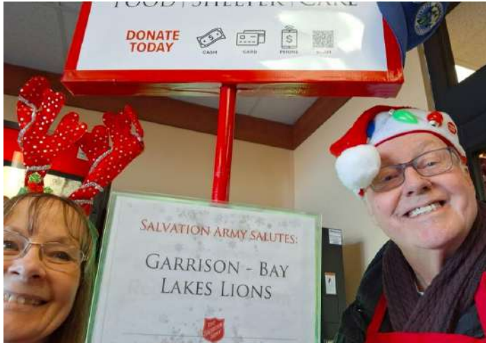
Garrison Bay Lake Area Lions were in Brainerd ringing bells for the Salvation Army!